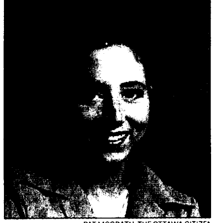
PAT MCGRATH, THE OTTAWA CITIZEN