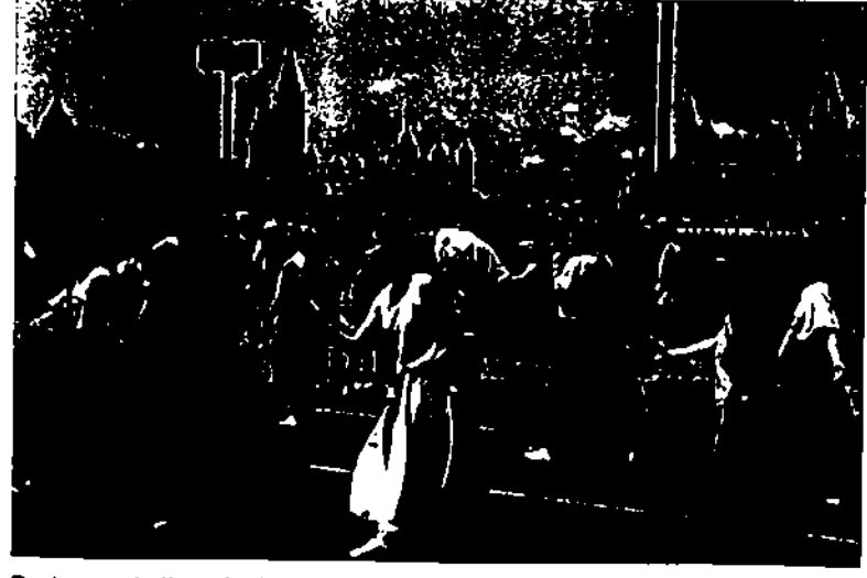
Redeemer's liturgical dancers march for Jesus in Ottawa.

Redeemer School faces financial challenges. Tuition is a set percentage of the parents' income, so tuition income drops when the economy is down (as does financial support from the business community). The school is using all of the facilities that it rents from the local school board and is looking for a larger building. Given its history, this community for Christian learning will find solutions cooperatively.