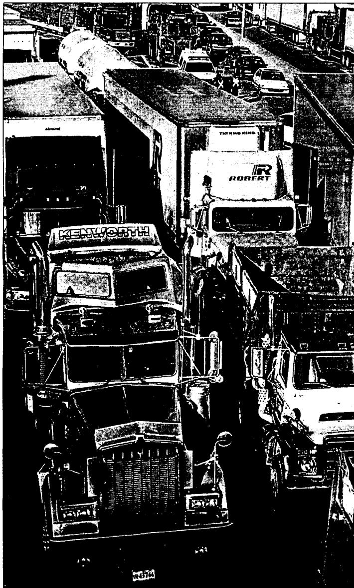
Proposed new rules for U.S. truck and bus operators will set weekly workload maximums that are 24 to 36 hours a week less than those permitted in Canada.

Predictably, the American Trucking Association (representing the larger U.S. transport companies) is crying financial distress over the new U.S. workload limits. Meanwhile, insurance and citizens groups complain that the proposals don't go far enough.