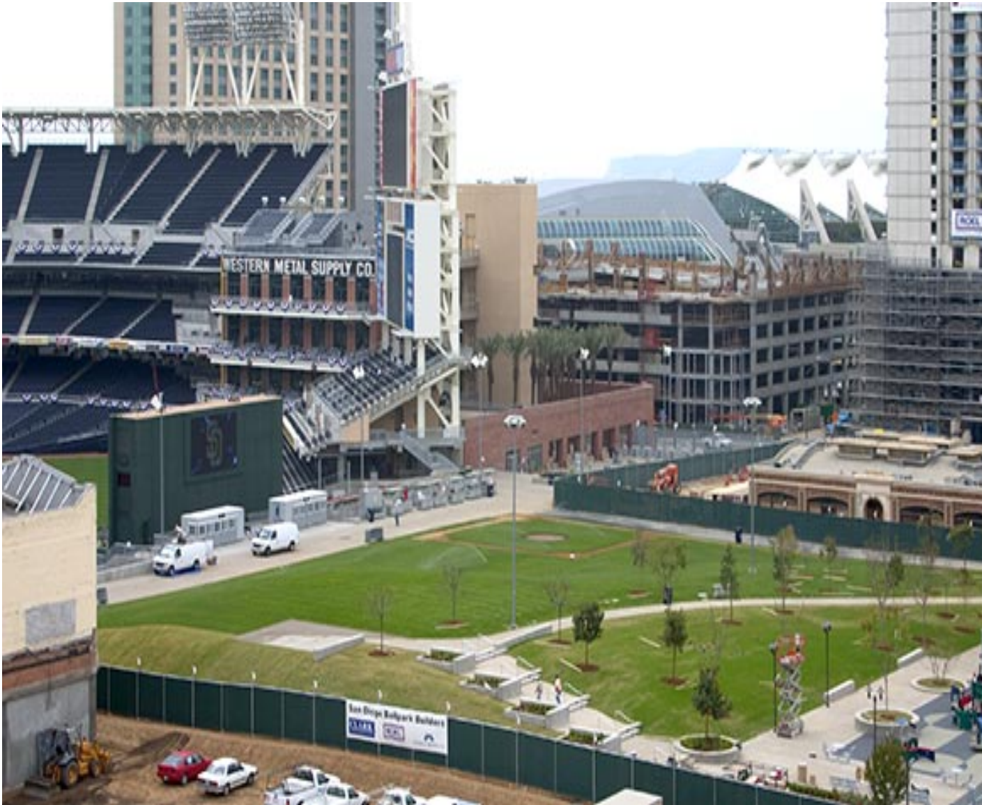
Figure 7. PetCo Park and the Ballpark District In San Diego