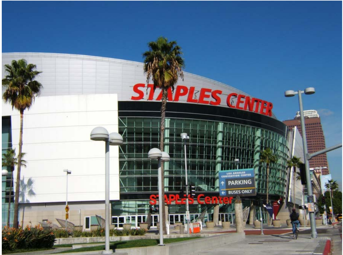
Figure 5. The Staples Center, Downtown Los Angeles